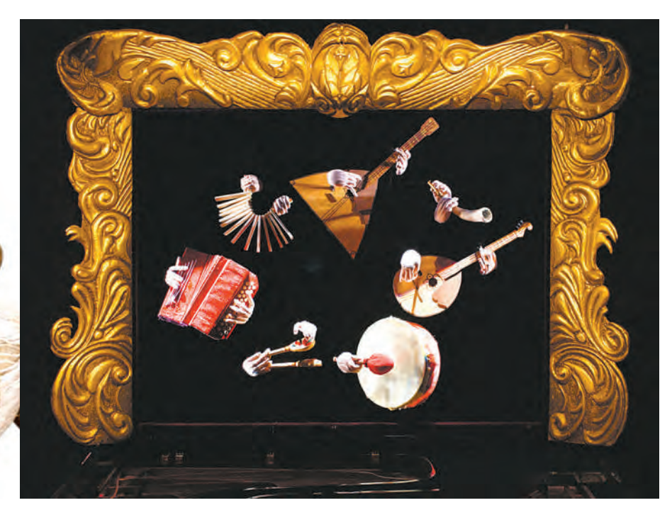
"PETRUSHKA": Instruments played by invisible musicians open the piece, which re-creates the Ballets Russes classic, left. It will play at the Lansburgh Theatre.

And "Symphonie Fantastique" also led to the Lincoln Center commission for